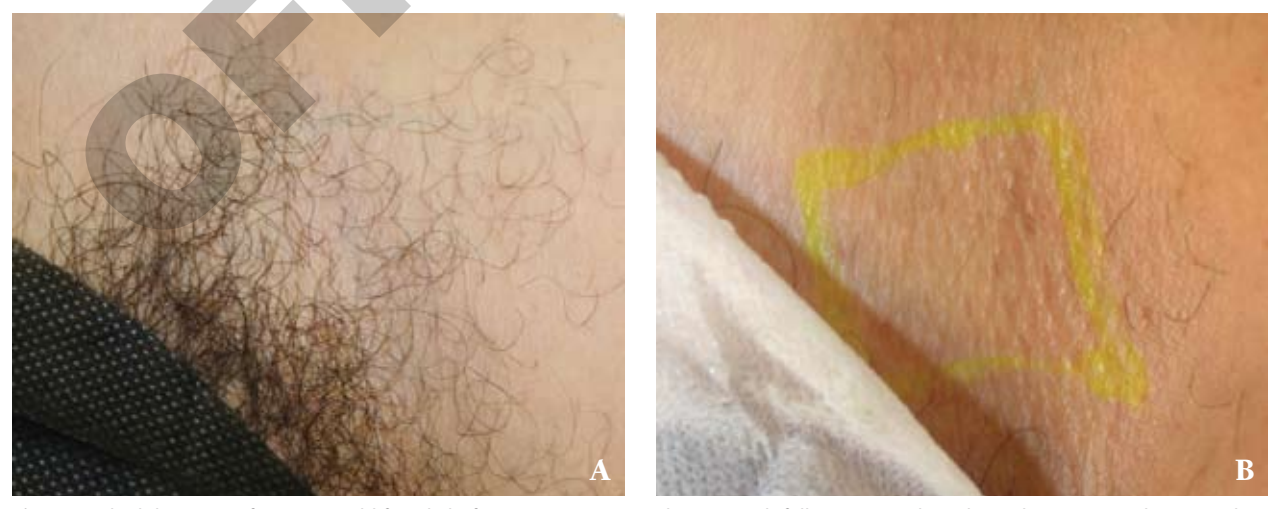
Figure 2. The bikini area of a 44-year-old female before treatment (A) and at 6-month follow-up (B) who achieved an 84.8% reduction in hair counts after 5 treatments with the 810-nm diode laser.

For a laser or light-based device, treatment time is determined by the coverage rate, which is the product of the area of the spot and the repetition rate.<sup>26,27</sup> In our study, the 810-nm diode laser spot was rectangular, measuring 12 \times 10 mm, so the area of the spot was 120 mm<sup>2</sup>. Since the repetition rate was 3Hz, the coverage rate is 360 mm<sup>2</sup>/s. The coverage rate of a comparable 800-nm diode laser device used for hair removal may be similarly calculated. In the study of Lou et al,<sup>13</sup> the spot of the 800-nm laser device was square shaped, measuring 9×9 mm. Since the maximum repetition rate of this device is 2 Hz,<sup>5</sup> the coverage rate is 162 mm<sup>2</sup>/s, less than half of the coverage rate of the 810-nm diode laser used in the present study. A square spot measuring 12×12 mm,