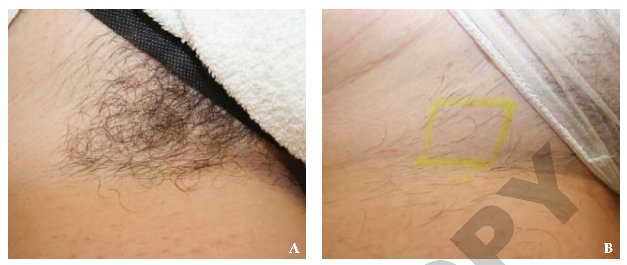
Figure 3. The bikini area of a 42-year-old female before treatment (A) and at 6-month follow-up (B) who achieved an 87.9% reduction in hair counts after 5 treatments with the 810-nm diode laser.

or 144 mm<sup>2</sup>, has also been used in published studies of the 800-nm diode laser.<sup>5</sup> With this larger spot, the coverage rate increases to 288 mm<sup>2</sup>/s, which is still lower than the 360 mm<sup>2</sup>/s of the 810-nm device. The shorter treatment time is an even greater advantage when the 810-nm diode laser is used to treat body areas larger than the bikini area, such as the back and legs.